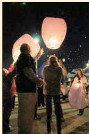
The participants in the Second Annual CRAP 5K Run released about 300 sky lanterns.