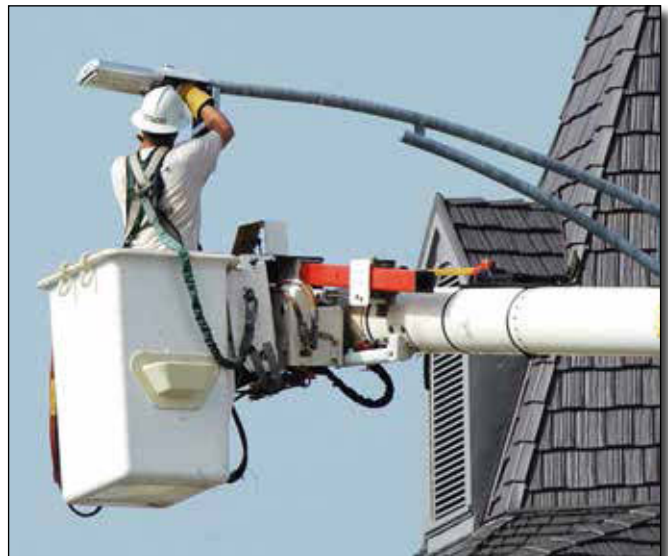
A City of LaFayette Electric Department employee installs one of the city's new LED cobrahead lights on a fixture in downtown.