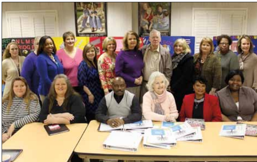
Employees from SAFE Family Services Center are participating in a year-long, nationwide initiative to create an evidence-based model for substance abuse and prevention programs.