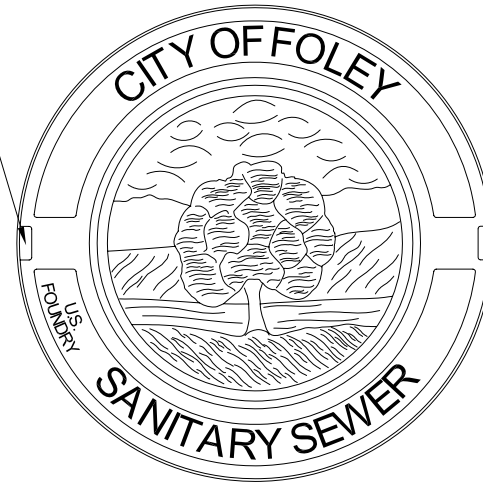
COVER TOP VIEW N.T.S.